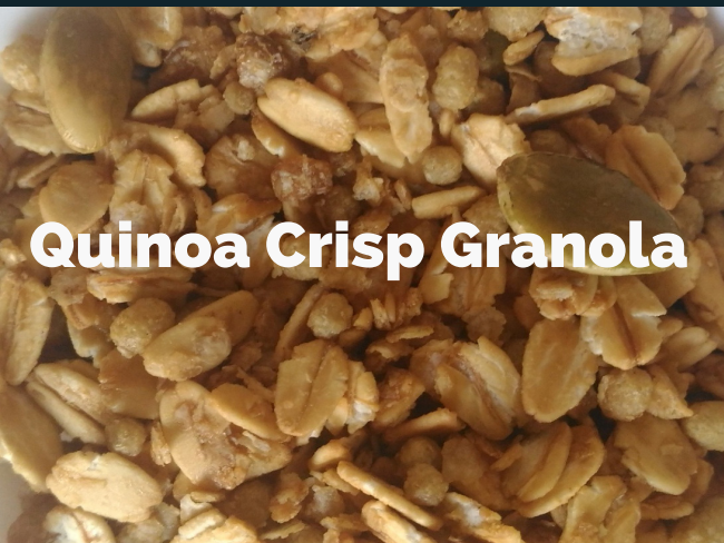
Quinoa Crisp Granola