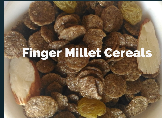
Finger Millet Cereals